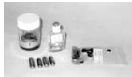
Figure 1. Containers of elemental mercury purchased at botanicas in New Jersey, New York, and Pennsylvania include gelcaps (weighing 10.8 g, 12.5 g, 7.4 g, and 9.3 g), jar, reused perfume bottle (teflon seal added after purchase), and plastic zip-lock bag.

In addition, we held conversations with babalawos (Santeria high priests) in Jersey